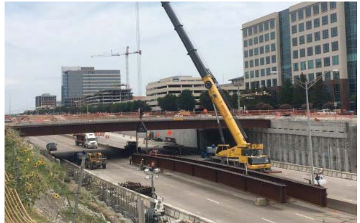
New beams at Tennyson Parkway